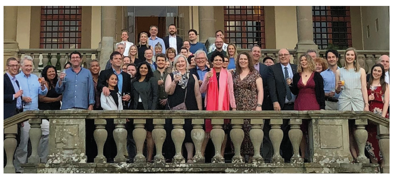
International Conference in Prato, Italy, 2019