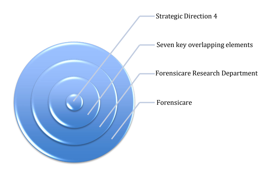
Figure 2. Strategic overview